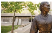
Short course Faith, Hope and Love

Please click HERE if you'd like to join.